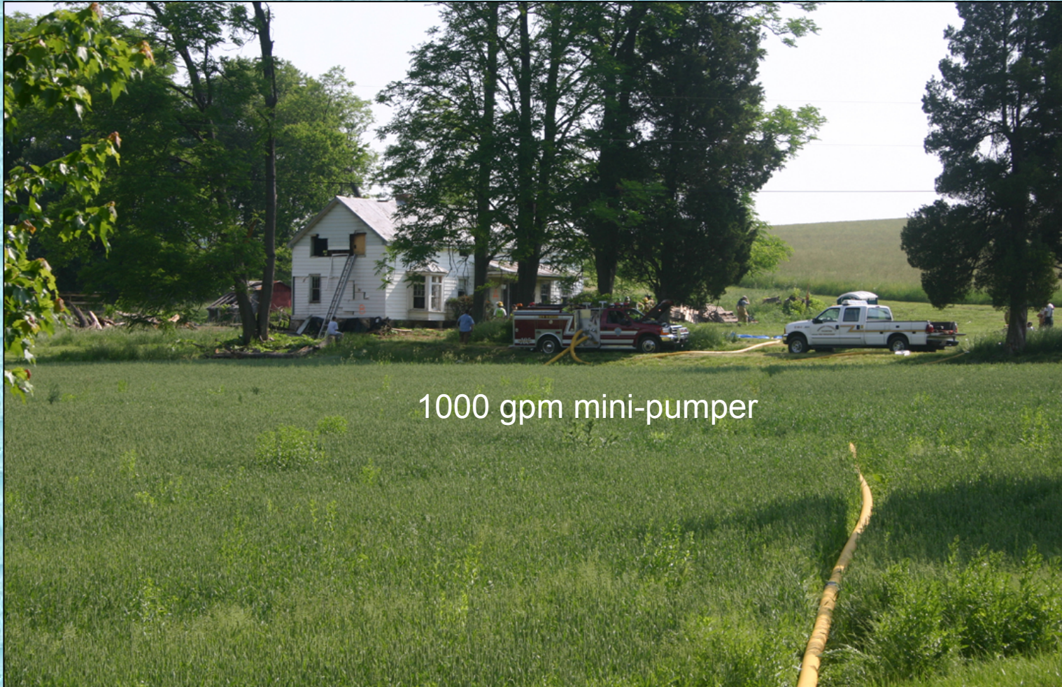
1000 gpm mini-pumper